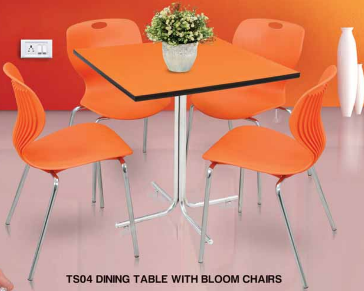
TS04 DINING TABLE WITH BLOOM CHAIRS