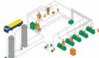
BCS series (Bry-Air Conveying System) 2.2 kw, 4 kw, 7.5 kw 11 kw with "x" number of station