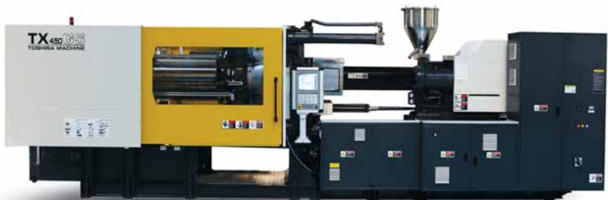
Model: TX 350 GS / TX 450 GS / TX 550 GS

Experience the difference with RAM Technology.