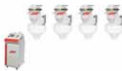
BVL Tetra series Auto Loader Tetra Engineered up to 2000 kg/hr