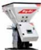
BGD series Gravimetric Blending 160 kg/hr to 2150 kg/hr Engineered Above 2150 kg/hr