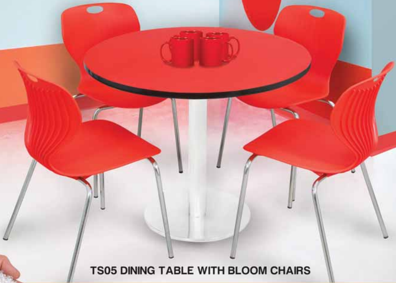
TS05 DINING TABLE WITH BLOOM CHAIRS

Scan this QR code using the QR Code Scanner App on your smartphone to download the full product catalogue of Swagath