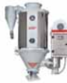
HAD series Hot Air Dryer 13 kg to 400 kg