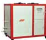
CHA series Chiller 3.5 TR, 7.5 TR & 10.5 TR